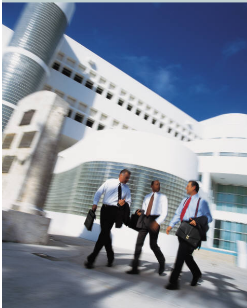
OUR NETWORK IS NOW THE MOST ADVANCED IN THE HIGH DESERT.

In the upcoming months, we will be upgrading our entire network to better serve you in the coming years. Clients who have already made the transition to paperless EMR or EMH office software will easily and securely have access to our database of your patient information. In this issue we will cover some of the advancements you will enjoy as a result of our upgrade. Some enhancements will be hidden, like our Triple Redundant Backups that ensure the safety, security and integrity of all data in our system. Others, such as custom letters to your patients regarding Treatment information, Laboratory results, follow up letters, or possibly any document you can imagine, will transform our database into a powerful tool for your day to day office routines. Some of the most simple matters, such as a copayment receipt, will be customized and printed for your patient at the time of service, and stored forever in our database for future reference. You will also have access to the most recent patient transactions and charges, as well as payment, denials, and a variety of information that will assist you and your staff when questions arise during a visit. Patients may even opt for statements via EMAIL—paperless billing, provided they are willing to sign a special waiver indicating their wish to opt out of regular postal delivery of their monthly bill. The sky has